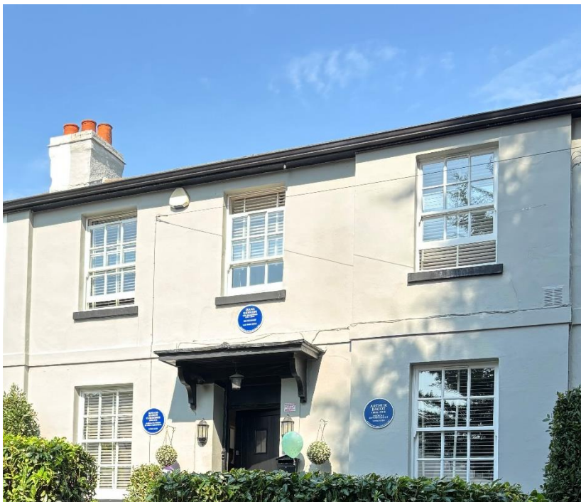
Three of the Plaques on display (the fourth being on the side flank wall) The latest plaque dedicated to Diana Kennedy is above the porch.