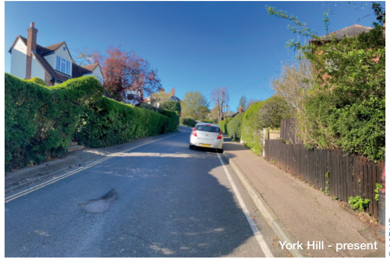
York Hill - present