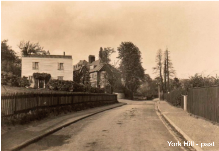
York Hill - past