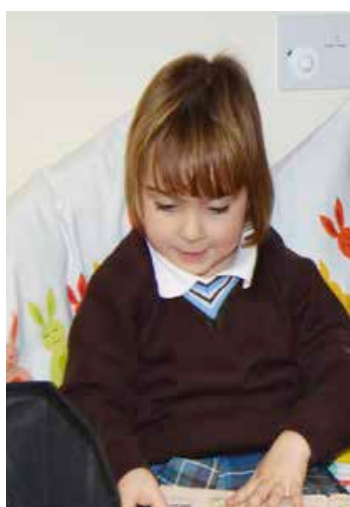
BRAESIDE SCHOOL Buckhurst Hill Ages 2 ½ to 16