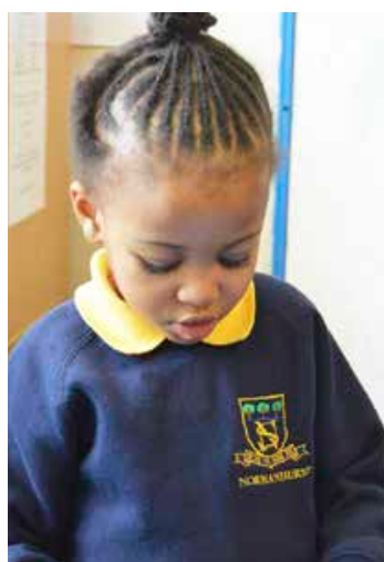
NORMANHURST SCHOOL North Chingford Ages 2 ½ to 16

OPEN EVENING: THURS 5 OCT EARLY YEARS: FRI 6 OCT