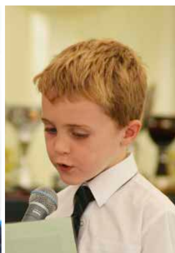
OAKLANDS SCHOOL Loughton Ages 2 ½ to 11

OPEN EVENING: THURS 5 OCT EARLY YEARS: FRI 6 OCT