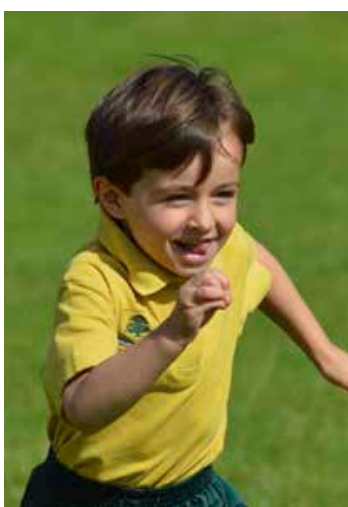
COOPERSALE HALL SCHOOL Epping Ages 2 ½ to 11