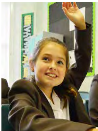
BRAESIDE SCHOOL Buckhurst Hill Ages 2 ½ to 16

Wed 4 Oct 9.15am (2 ½ to 11) Wed 4 Oct 6pm (11+)