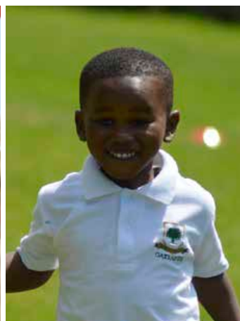
OAKLANDS SCHOOL Loughton Ages 2 ½ to 11

Thurs 5 Oct 6pm (5 to 16) Fri 6 Oct 9.15am (2 ½ to 4)