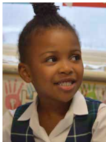
NORMANHURST SCHOOL North Chingford Ages 2 ½ to 16

Thurs 5 Oct 6pm (5 to 16) Fri 6 Oct 9.15am (2 ½ to 4)