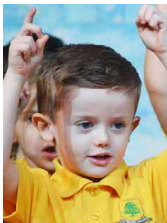
COOPERSALE HALL SCHOOL Epping Ages 2 ½ to 11

Wed 4 Oct 9.15am (2 ½ to 11) Wed 4 Oct 6pm (11+)