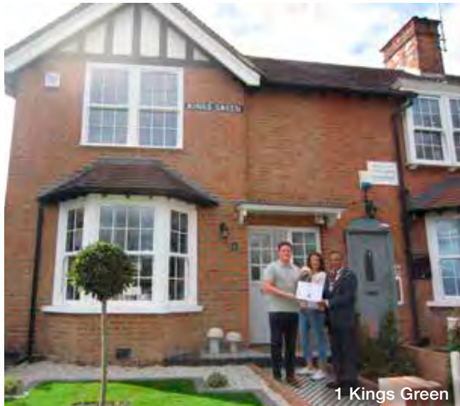
1 Kings Green

The photographs show the winners of certificates of commendation in 2018.