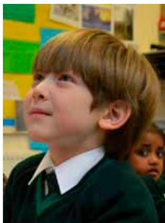
OAKLANDS SCHOOL Loughton

Ages 2 ½ to 16 020 8529 4307 www.normanhurstschool.co.uk