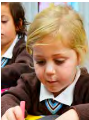
BRAESIDE SCHOOL Buckhurst Hill

Ages 2 ½ to 16 020 8504 1133 www.braesideschool.co.uk