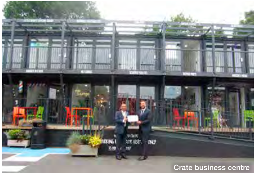
Crate business centre