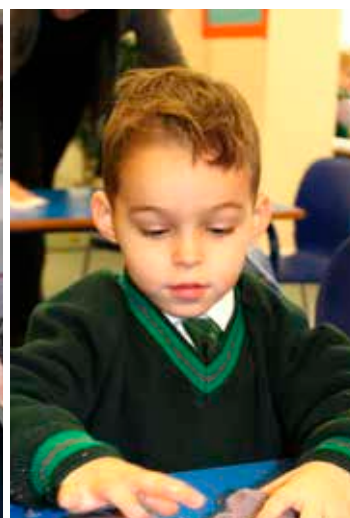
OAKLANDS SCHOOL Loughton Ages 2 ½ to 11