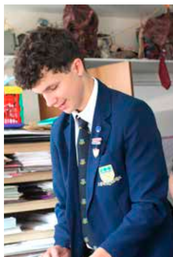
NORMANHURST SCHOOL North Chingford Ages 2 ½ to 16