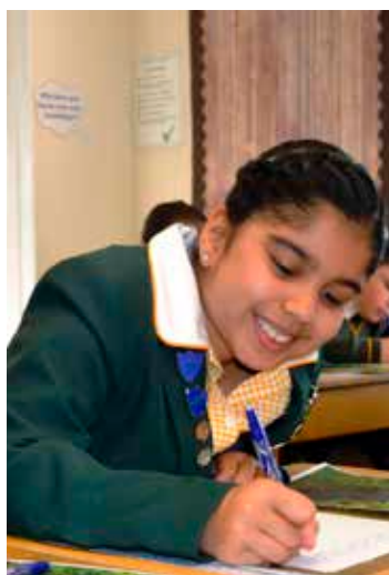
COOPERSALE HALL SCHOOL Epping Ages 2 ½ to 11