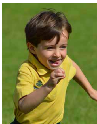
COOPERSALE HALL SCHOOL Epping

Ages 2 ½ to 16 020 8504 1133 www.braesideschool.co.uk