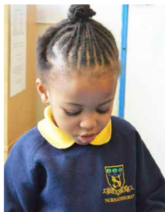
NORMANHURST SCHOOL North Chingford

Ages 2 ½ to 11 01992 577133 www.coopersalehallschool.co.uk