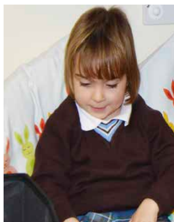
BRAESIDE SCHOOL Buckhurst Hill

Ages 2 ½ to 16 020 8504 1133 www.braesideschool.co.uk