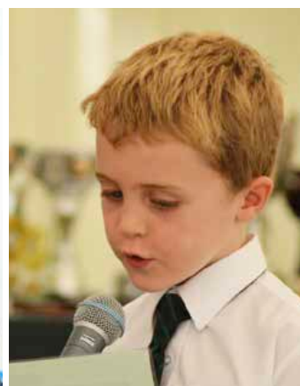
OAKLANDS SCHOOL Loughton

Ages 2 ½ to 16 020 8529 4307 www.normanhurstschool.co.uk