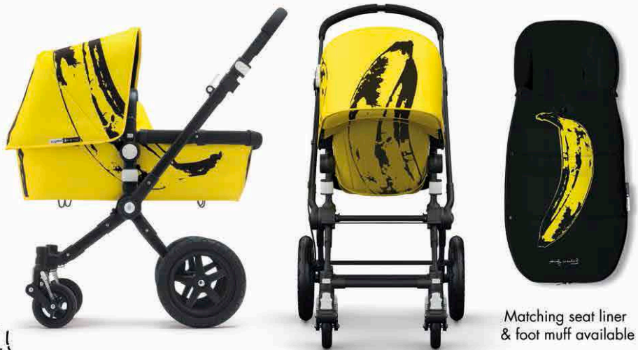
Matching seat liner & foot muff available

We are 1 of only 10 stores to stock the limited edition. Only 200 available in the UK!