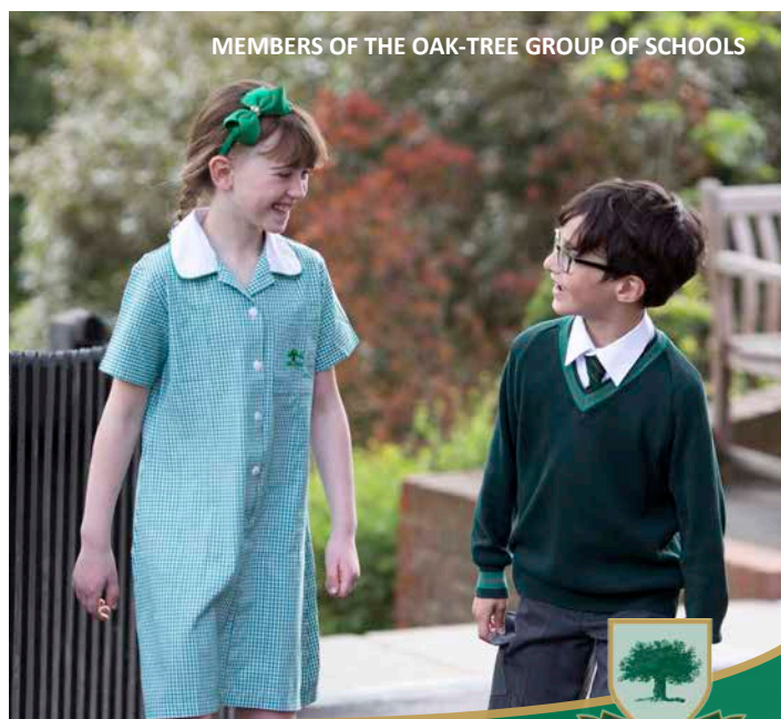
MEMBERS OF THE OAK-TREE GROUP OF SCHOOLS