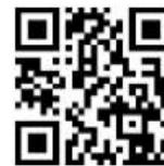
GOOGLE MAPS QR CODE

GOOGLE MAPS - https://goo.gl/maps/xYGh9rvVQ2Crjec8