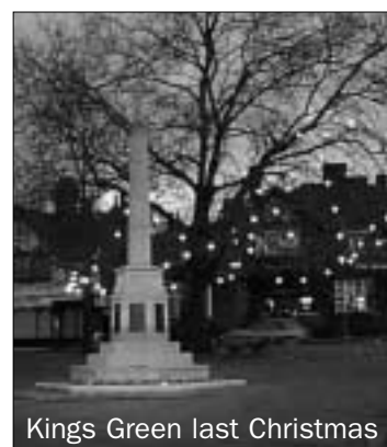
Kings Green last Christmas

To sponsor a light, please call 01279 413590.