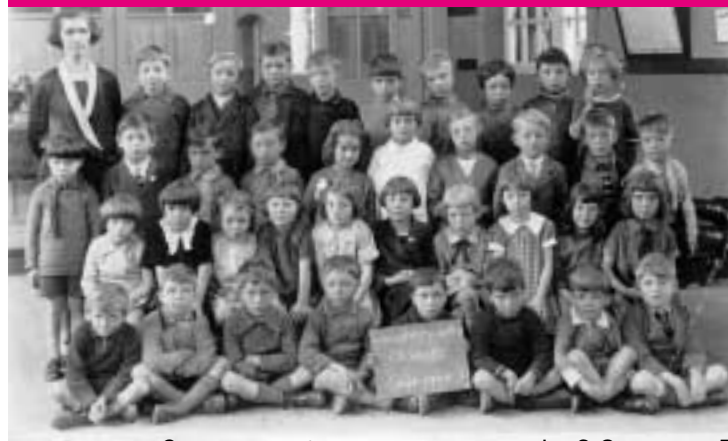
Can you spot anyone you recognise? See page 7