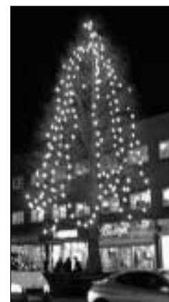
Christmas lights in the High Road

O N SATURDAY 25 November, Loughton became a blaze of colour as the Christmas lights in the High Road were switched on.