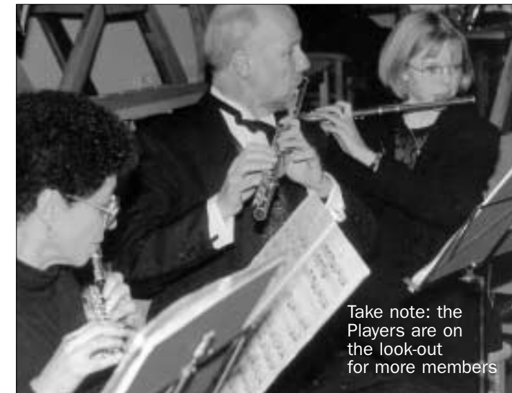
Take note: the Players are on the look-out for more members

We give three concerts a year and recently we have branched out to share our platform with