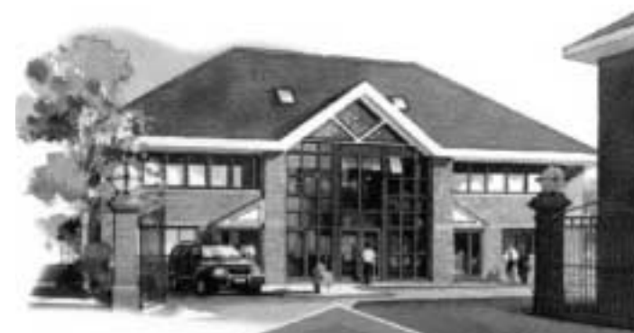
An artist's impression of Buckingham Court, in Rectory Lane

■ Sufficient space for staff requirements, with the possibility of expansion in the long term