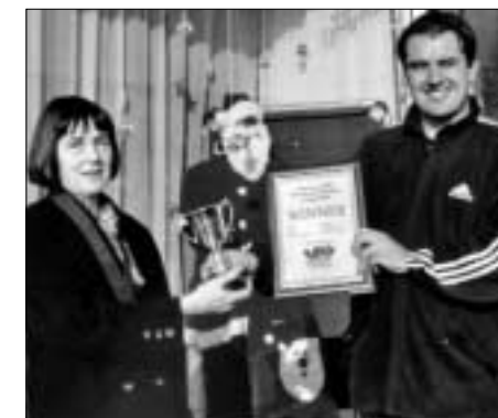
Window dressings: Intersport, left, and Flowers & Co, right, receive their Best Dressed Window Competition certificates