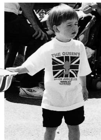
Hats off to Debden Day

The day was made possible by the hard work not only of the Town Centre Partnership but also the many other helpers who gave their time on the day and in the run up to the event.